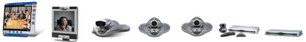
PVX VSX 3000 VSX 5000 VSX 6000 VSX 7000s VSX 7000e VSX 8000